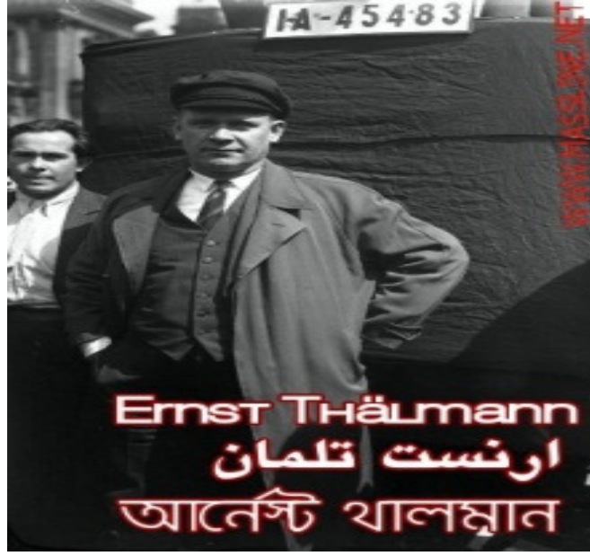
Ernst Thälmann ارنست تلمان আর্নেস্ট থালম্যান